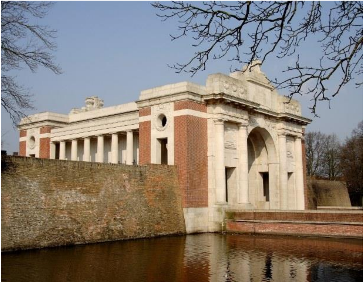
Menin Gate Memorial, Ypres, Belgium