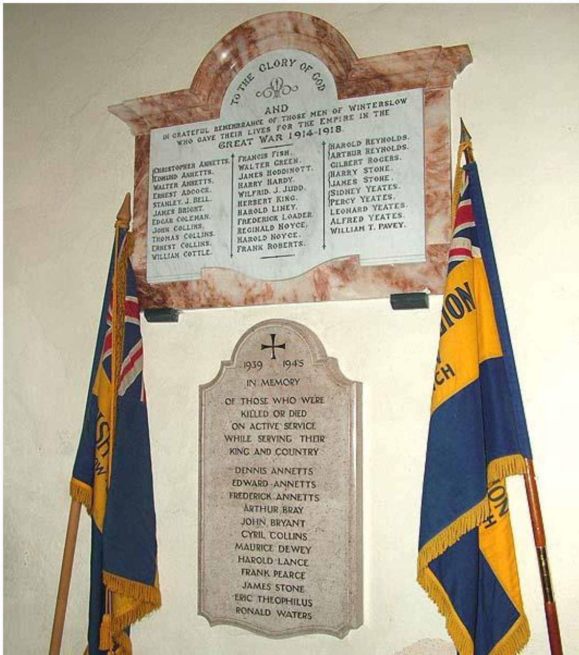
The Roll of Honour Plaque inside All Saints Church, Winterslow