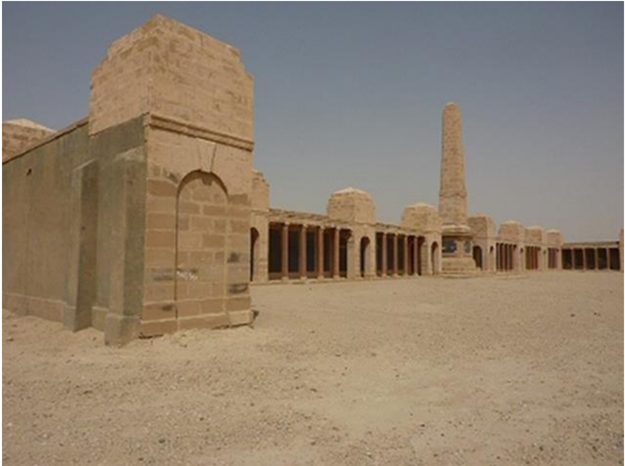
Basra War Memorial, Iraq