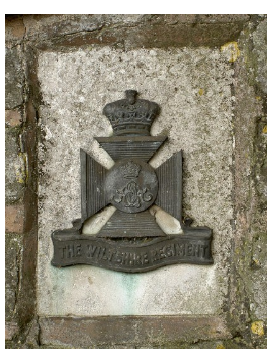
Wiltshire Regiment Badge