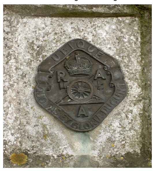
Royal Artillery Badge