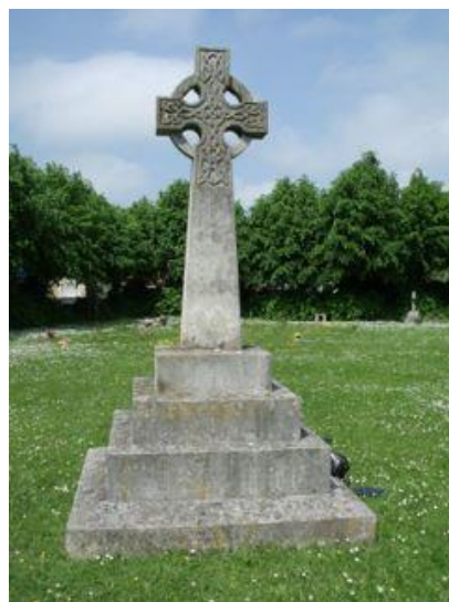
Holy Trinity Trowbridge War Memorial