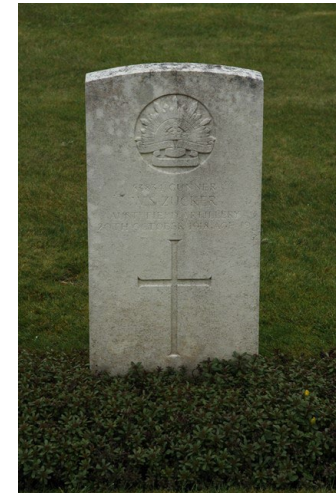
Headstone at Tidworth