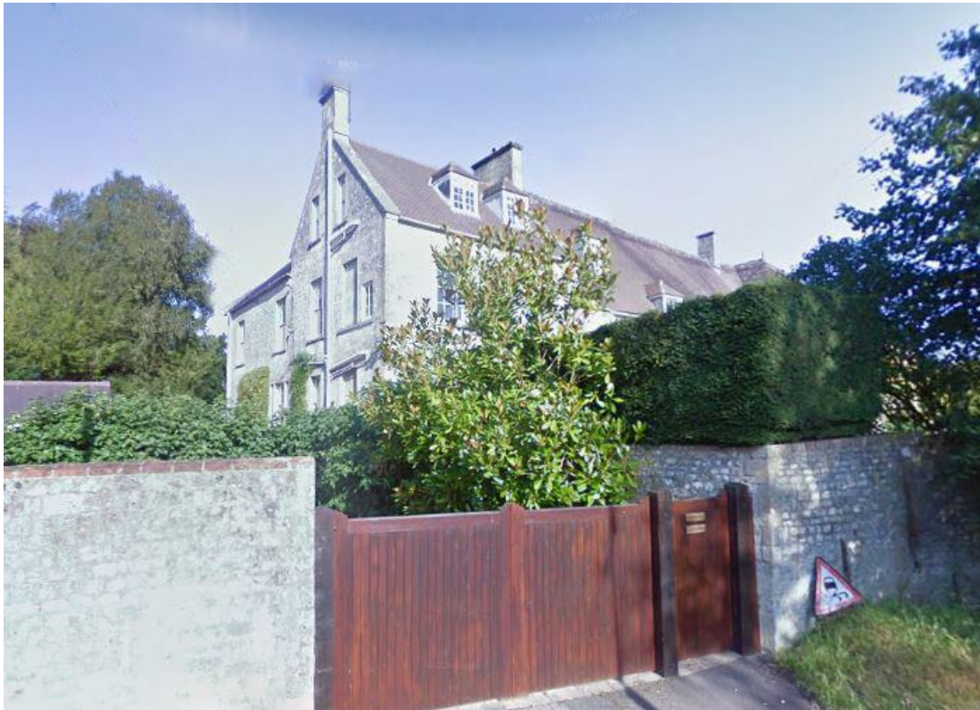
Old Manor House, Sutton Veny