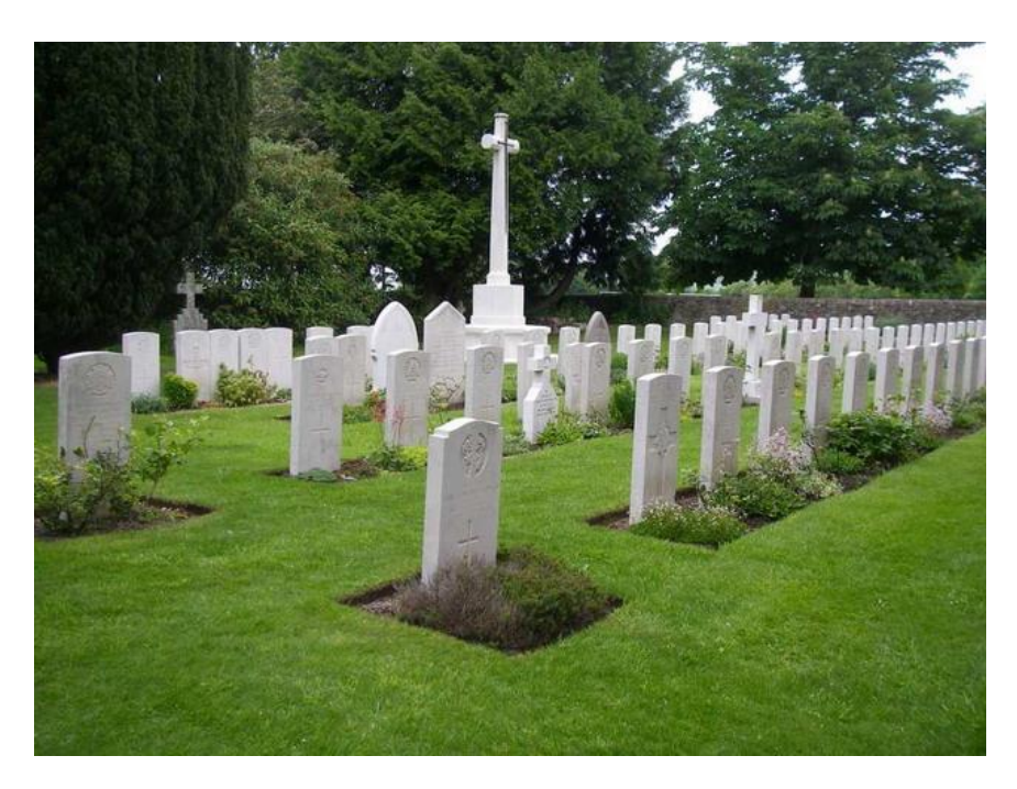
War Graves at Sutton Veny (Photos from CWGC)