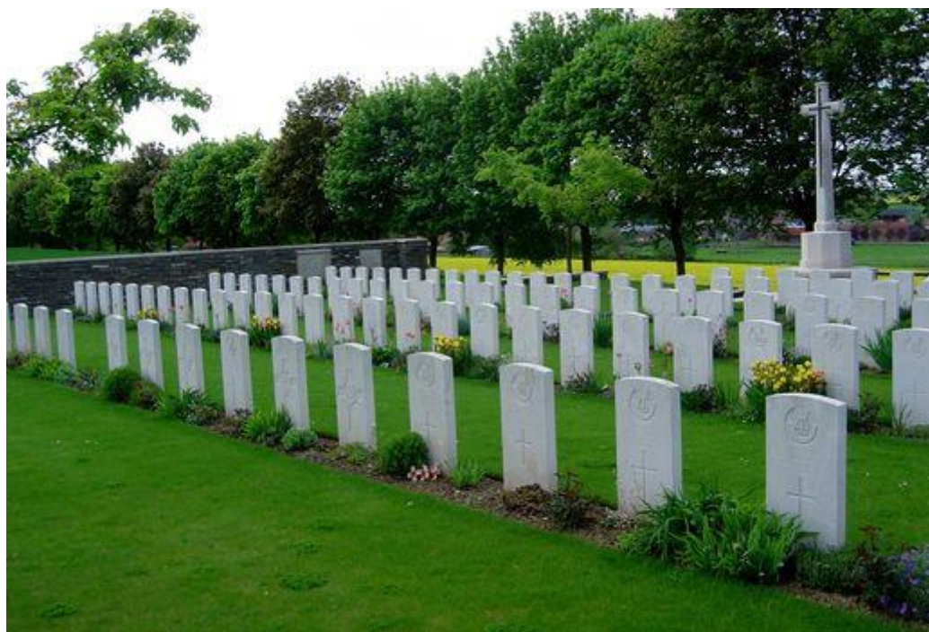
Heninel Communal Cemetery Extension