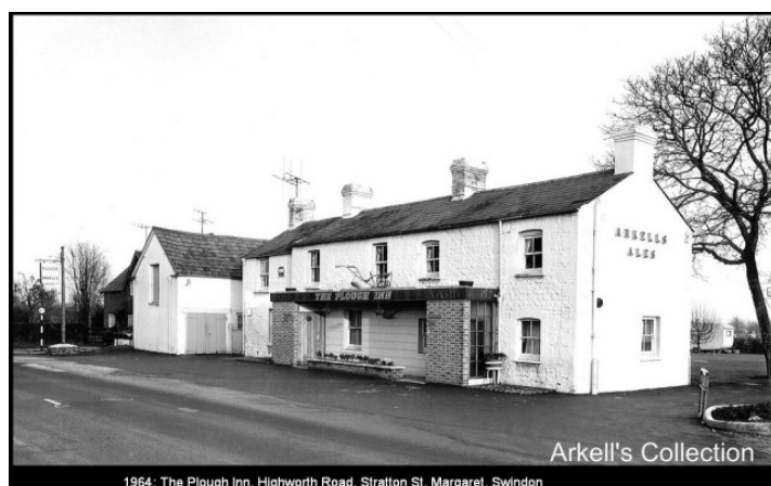
1964: The Plough Inn, Highworth Road, Stratton St. Margaret, Swindon