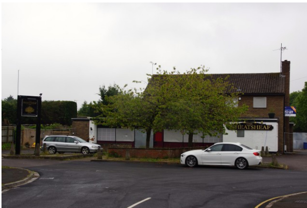
The Wheatsheaf , 33 Dores Road (no.30 in 1970)