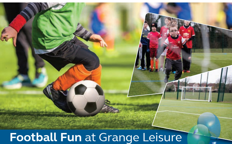
Football Fun at Grange Leisure