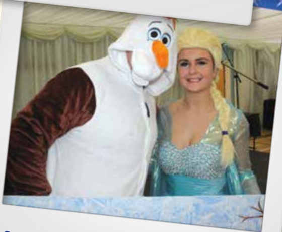
Olaf and Elsa at the Christmas Extravaganza 2014