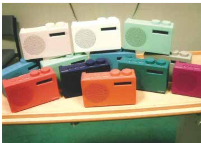
Digital radios purchased for the ICU in December last year

The evening concluded with a Cheese & Wine reception where residents mingled with the local Parish Councillors.