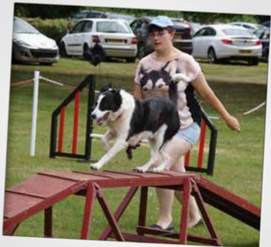
Dog Agility show Stratton Festival 2013