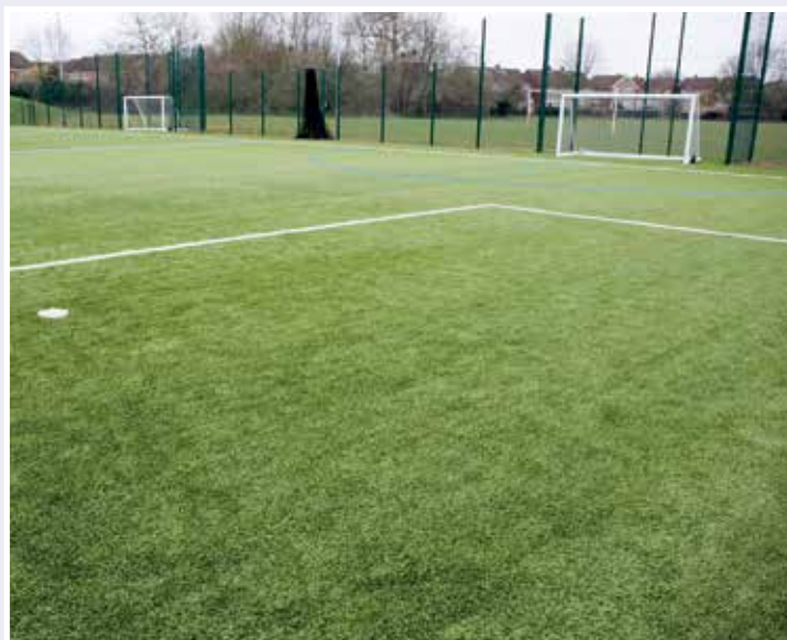
The New All-Weather Pitch

“ After much debate the Council has taken the decision, on financial grounds, not to renew the contracts to empty dog bins for other local Parishes ”