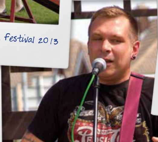
Live Music at Stratton Stroll 2013