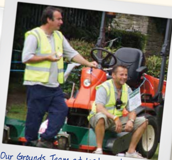
Our Grounds Team at last year's Stratton Festival