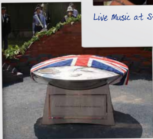
Peace Memorial Dedication 2014