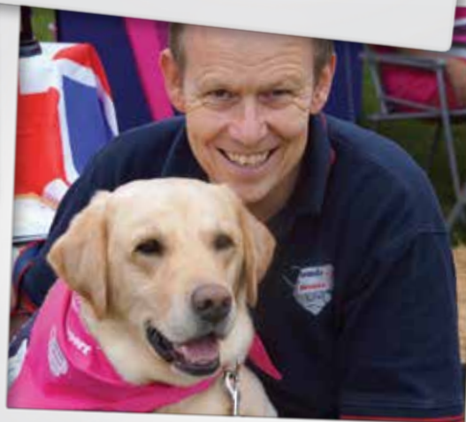
Having fun at The Stratton Festival in 2013