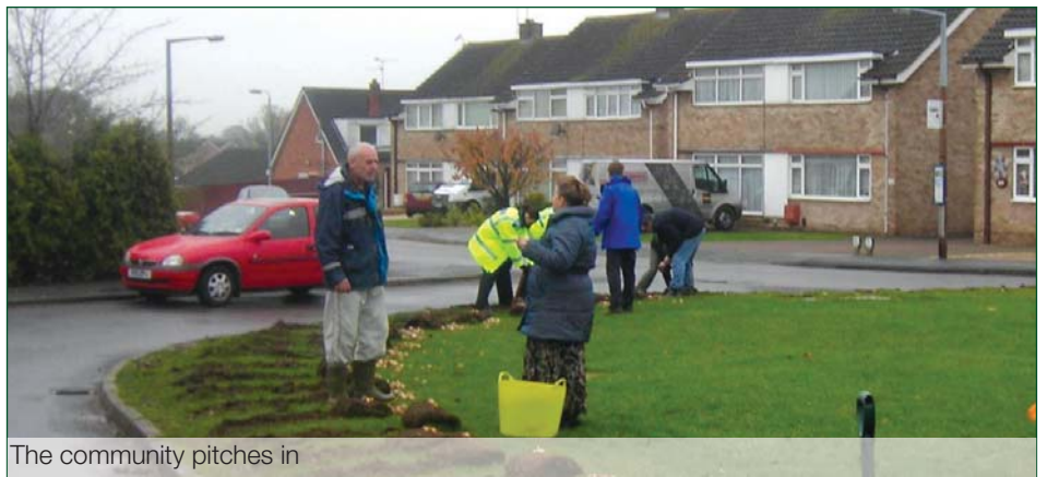
The community pitches in