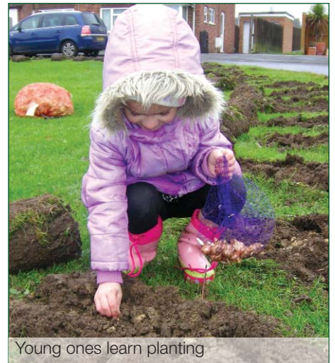
Young ones learn planting

Our thanks go to all those residents who attended, making the two days so successful. Thanks also go to the grounds team of Stratton St Margaret Parish Council who carried out site preparation and tidied up afterwards.