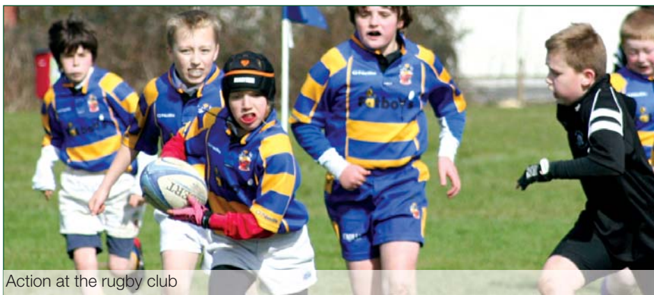
Action at the rugby club

Swindon Rugby Football Club has a long history. SRFC was founded in 1895, but its roots go back to Swindon Rangers Rugby Football Club, which was formed in 1870. This continuity, going back over 140 years, makes SFRC one of the oldest rugby clubs in the world; quite an achievement in itself, and something that the Parish Council believes is worthy of support.