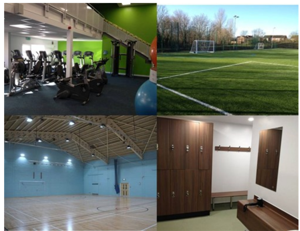
Grange Road Leisure Centre