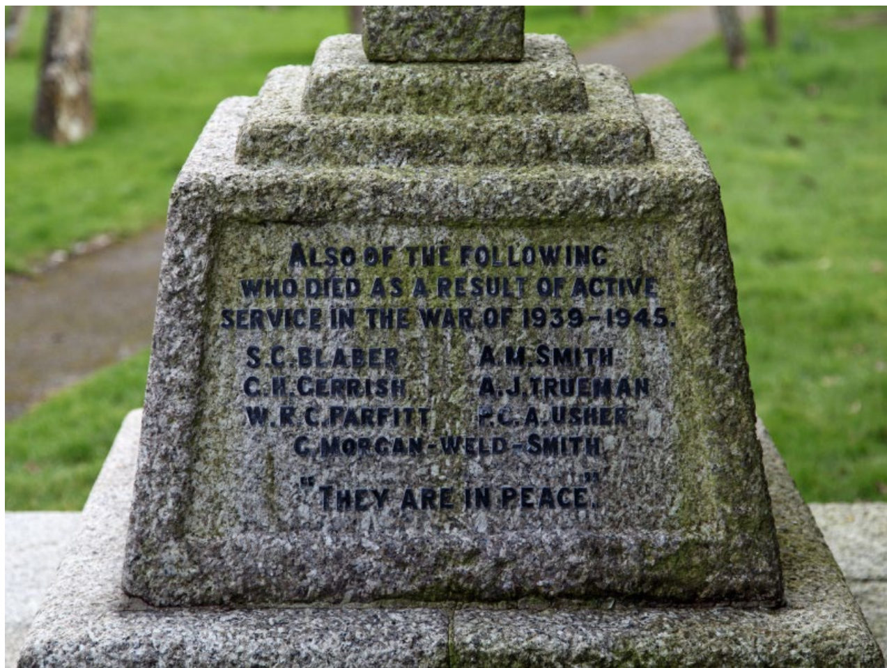
Seend War Memorial 1939 – 1945 Panel