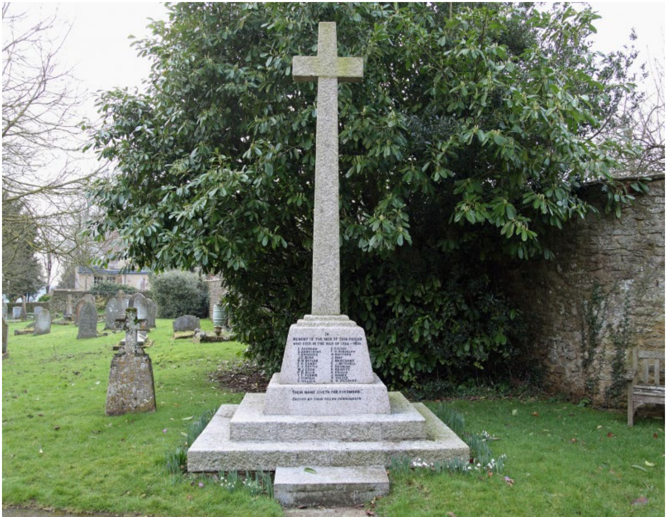
Seend War Memorial