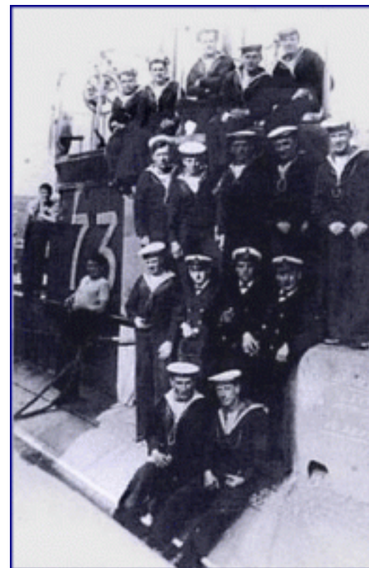
The crew of HMS D3