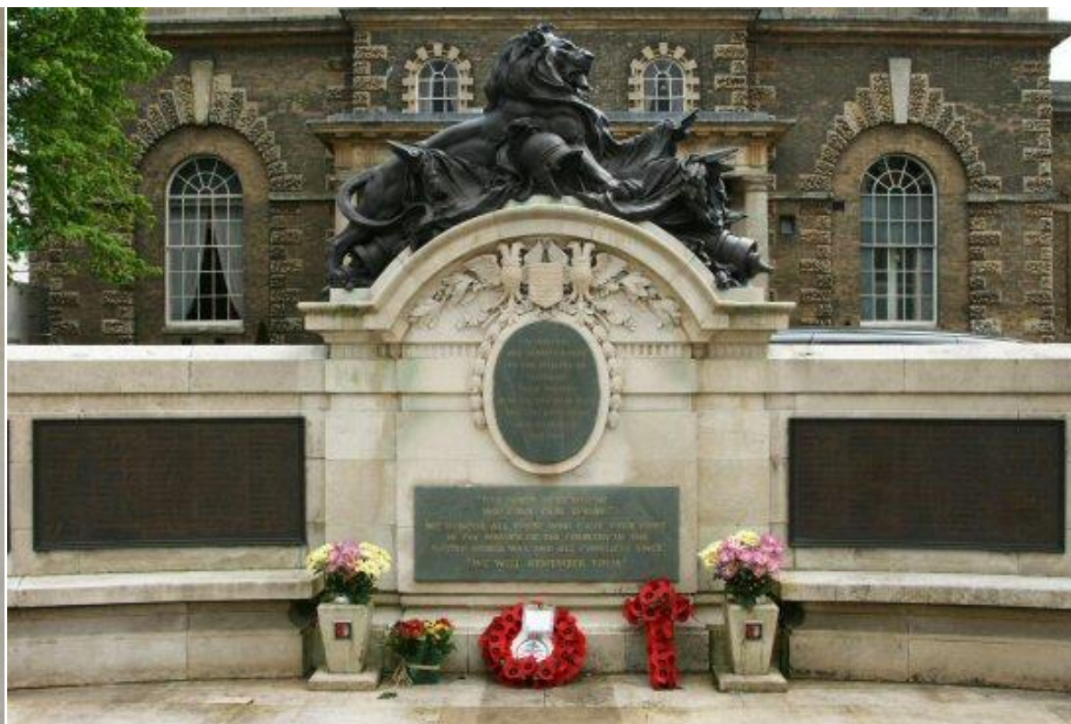
Guildhall Square War Memorial, Salisbury

HMS D3 was one of eight submarines of its class, built for the Royal Navy during the first decade of the 20th century.