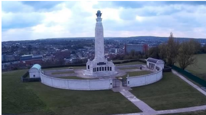
Chatham Naval Memorial