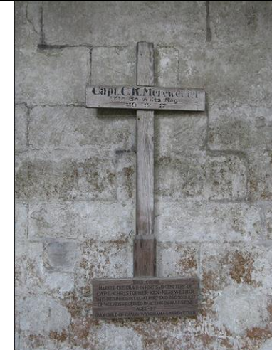
Named on the Winchester College War Cloister, Winchester, Hampshire (Outer 6)