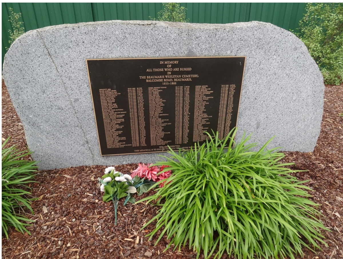
The plaque listing the names of those buried in the Beaumaris Wesleyan Churchyard, Victoria, Australia

This item was compiled from information supplied by :-