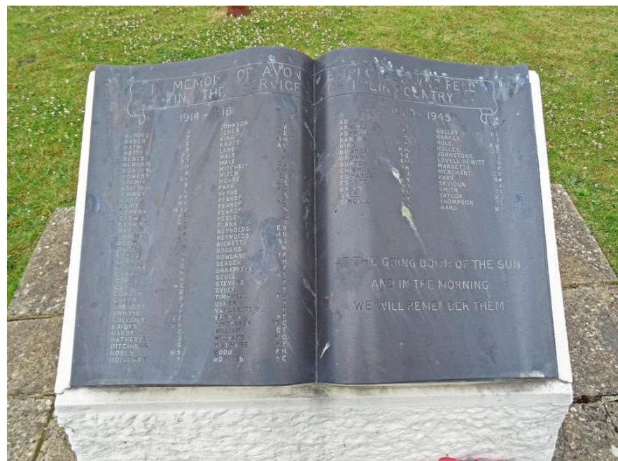
Avon Tyres Melksham War Memorial