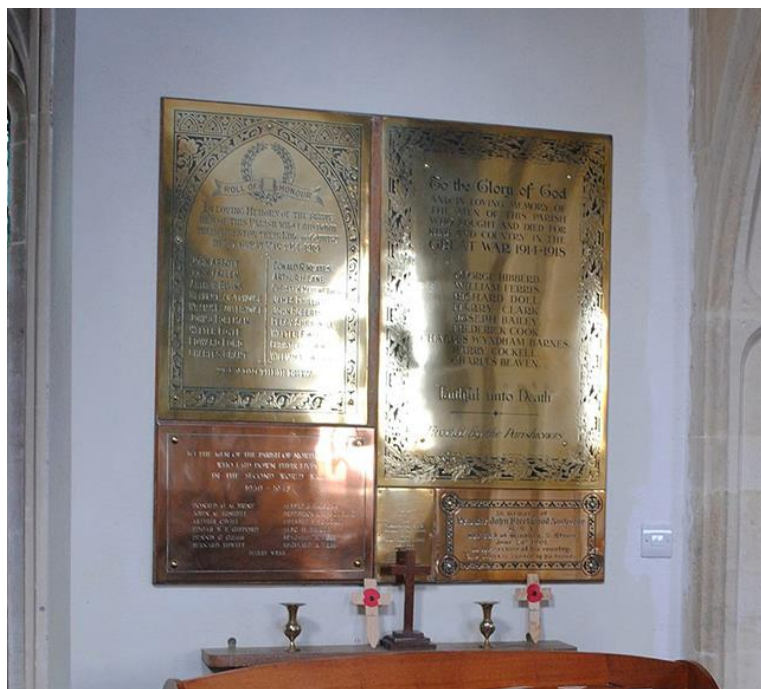
North Bradley Church Memorial Plaques