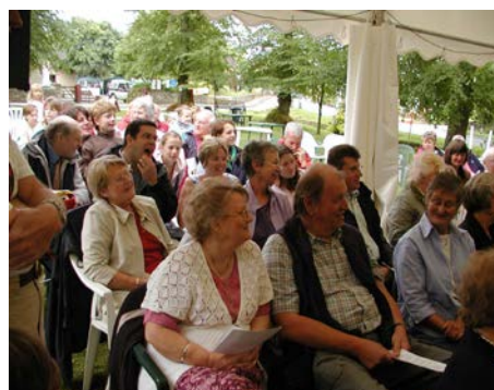
Service on the Green - Crudwell

The current pattern of services is set out below. It shows a diverse range of styles (BCP, CW and informal worship) reflecting many different approaches to worship across the benefice, with a good degree of lay leadership. On fifth Sundays we hold a single Eucharistic service in one of the six churches taken in rotation. Other special events such as Ash Wednesday and Good Friday are also served collectively. We expect the future schedule will be reviewed under the leadership of the new incumbent.