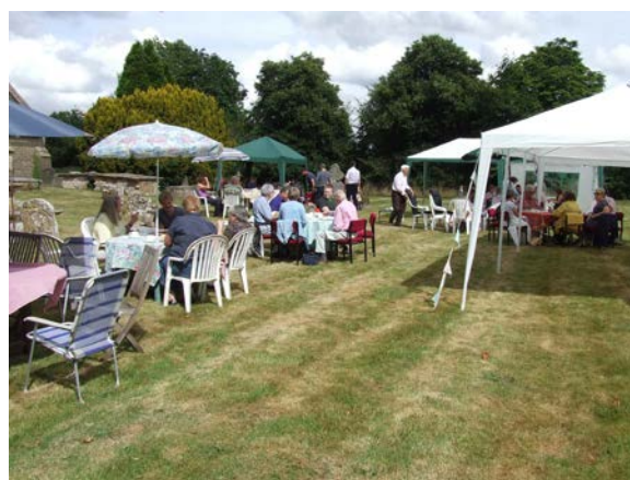
The Hankerton Strawberry Tea takes place in the churchyard

There are several well supported local voluntary organisations and their activities are advertised in the village newsletter, delivered to all houses. There is also a village website. Since there is no separate village hall, the North Aisle of the Church is used for regular meetings of the Parish Council and the PCC. It is also used for meetings of the History Group, exhibitions at the annual Street Fayre and other social functions.