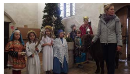
42 Parents & Children (& a Pony!!) enjoy the delights of our Nativity Service