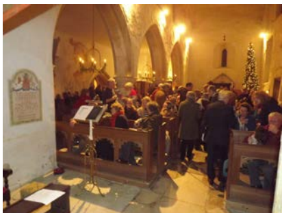
140 Parishioners enjoying their sherry & mince pies after our Carol Service

Oaksey is renowned for its strong sense of community with a population of 500 and 100 properties. The community includes farmers, retired people, commuters, long-standing families, self-employed and young families, all of whom enjoy the use of a village-owned shop and Post Office, a pub & a golf course. Community services include a playing field with children's play area, a village hall, sports pavilion & youth club. The CofE school has 76 children, of which a third live in the Parish. The school is investigating moving towards academy status. It regularly has excellent OFSTED reports & has an active PTA.