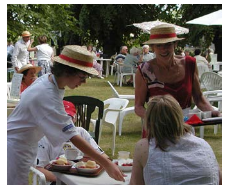
Serving at the Strawberry Fayre

"We need a minister who is energetic and fun – because there is a lot for them to do"