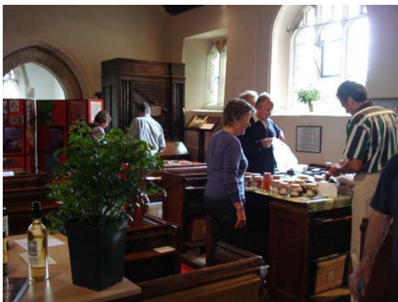
Part of the Hankerton Street Fayre takes place in the Church

Hankerton has a population of 240 (over age 18) plus approximately 30 aged under 18. They live in 115 properties. There is a varied community, ranging from retired people, commuters, locally employed, self-employed, long standing families and a few farms.