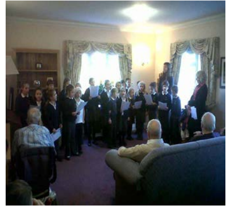
Minety School Children singing carols to the residents of White Lodge Care Home

The PCC has established good links with the village CofE school. The OLM, a Lay Minister and the Verger all conduct School Assemblies weekly, and the school actively engages in Festival Services such as Harvest and Mothering Sunday. The School catchment area includes several of the surrounding villages.