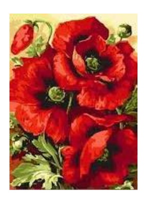
St. Martin, Milford World War I Casualty Biographies