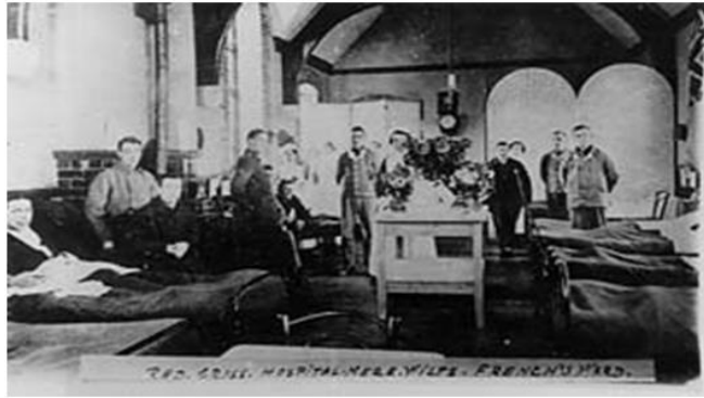
The VAD Hospital run by the British Red Cross Society 1914-1919

In the present building you will find a large wooden commemorative plaque naming all those who volunteered at the hospital during the Great War. Below is a list of names in alphabetical order that appear on the commemoration and the accompanying descriptive text.