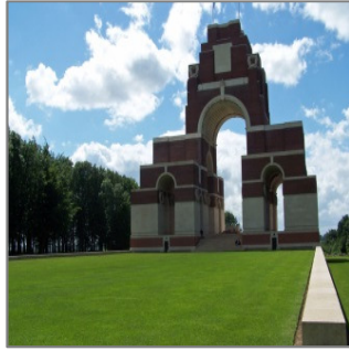
Thiepval Memorial France