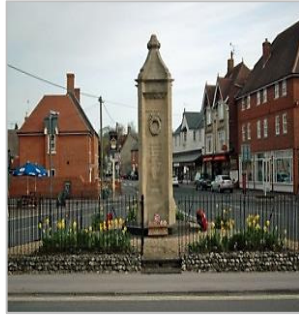
Ludgershall War Memorial