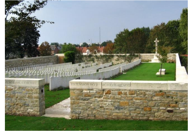
Doullens Communal Cemetery Extension No.2, Somme, France