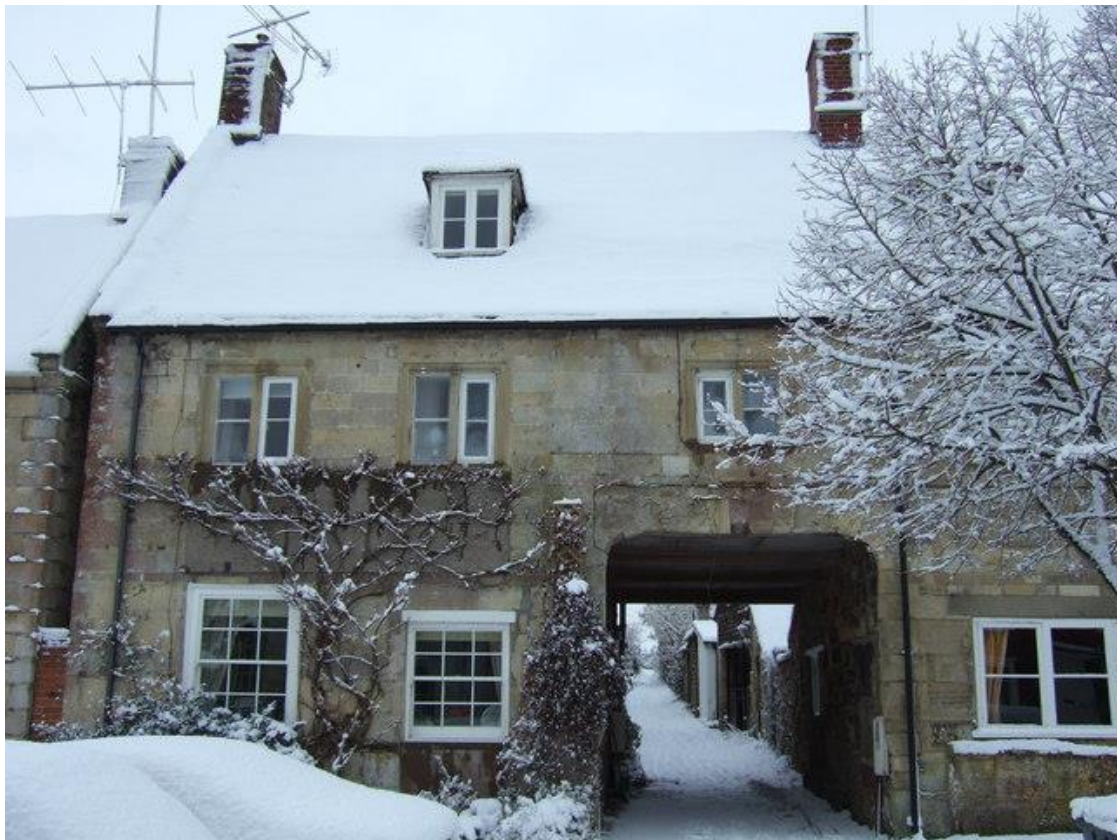
Baker's Arch, High Street with Lane leading to Says Cottages