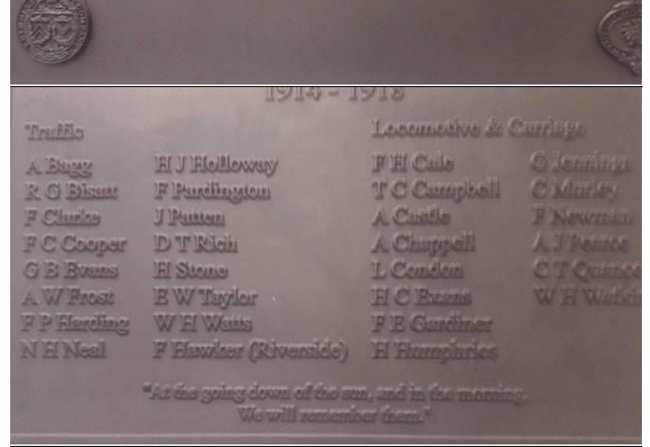
GWR Memorial Plaque, Cardiff Central Station

Er oof andiyeledekus am weithwyr rheilffordd Caerdydd a roddodd eu bywydau drod gwlad yn Rhyfel Mawr 1914-1913 a'r Ail Rhyfel Brd 1939-1945.