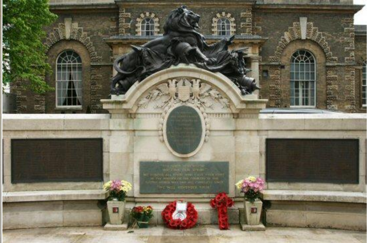
Guildhall Square War

Guildhall Plaque showing George Sanger's Name →