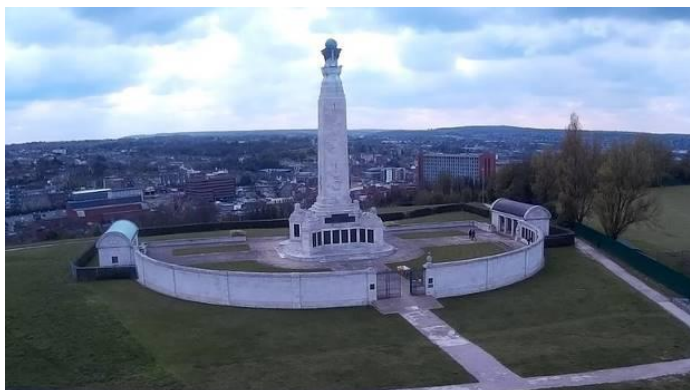
Chatham Naval Memorial