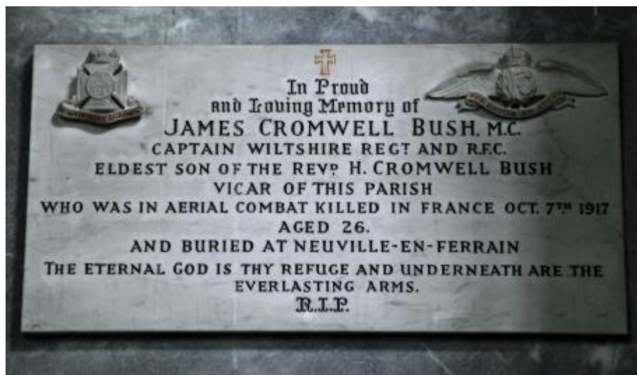
Memorial Plaque in Holy Cross Church, Seend