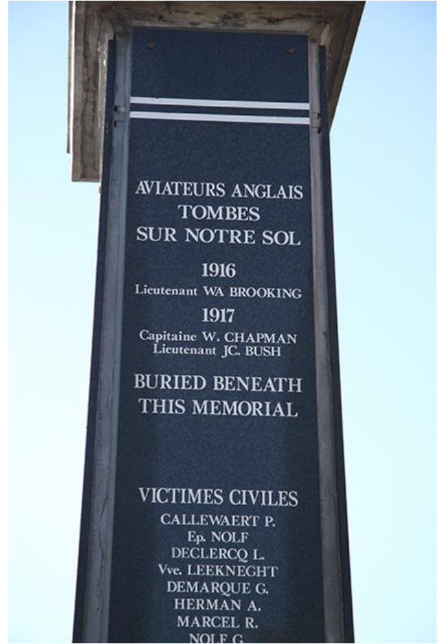
War Memorial in Neuville-En-Ferrain Communal Cemetery, France