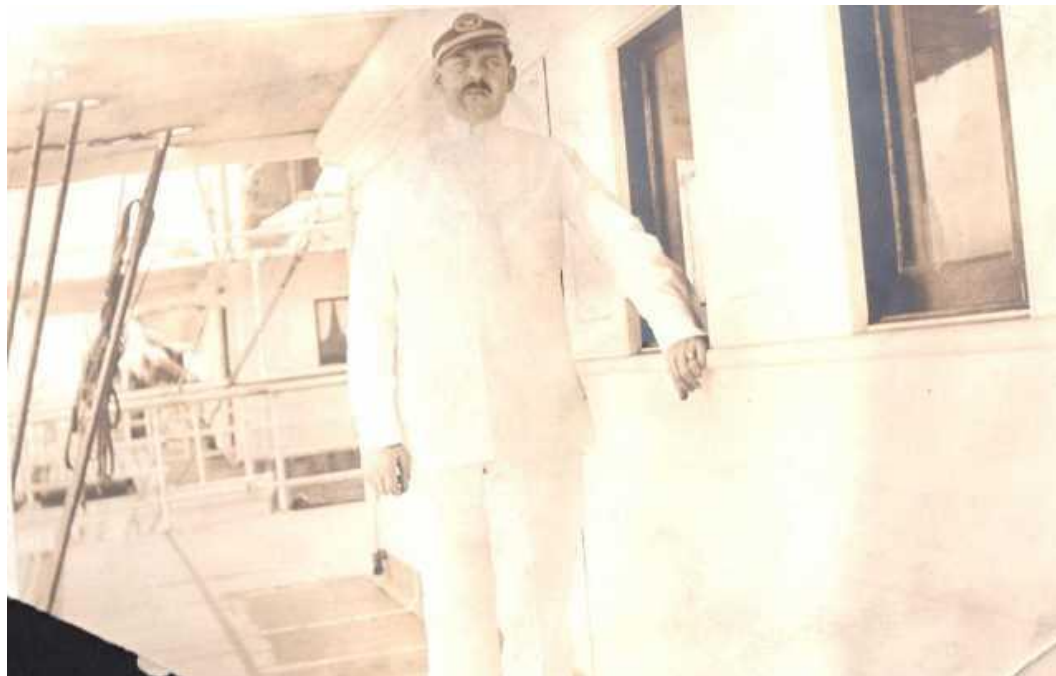
Clifford Still Aboard the S. S. Allianca in 1914