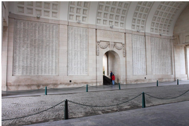
WWI Names panel on Atworth War Memorial