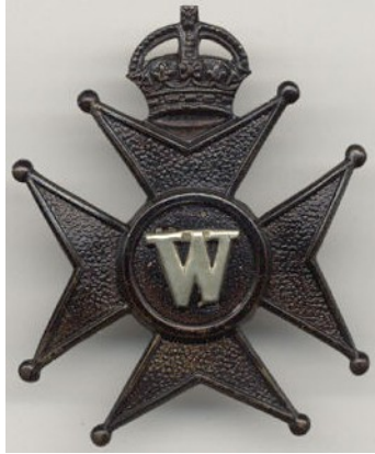
Wiltshire Constabulary Badge