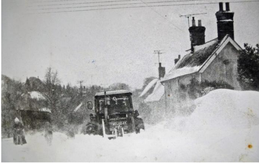
The Street in February 1978 - Michael Hull clearing the snow

In February 1978 East Knoyle was hit by a severe snow storm driven by gale force winds that led to drifts up to 20 feet high.