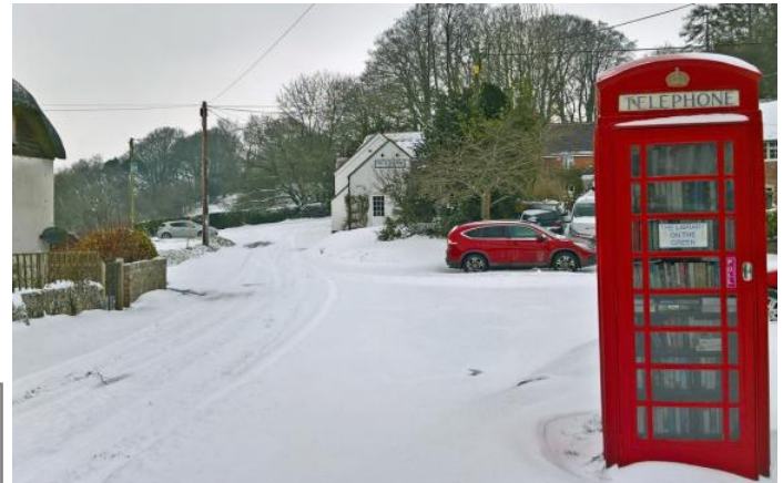
The Green - March 2018

Footnote - Did you know that the Village Scrapbooks are available to everyone? They make fascinating reading on the 'old days' of East Knoyle. To access them contact Joan Claydon on 830 269.