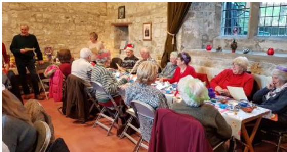
Everyone enjoying the Tea@3 Christmas party