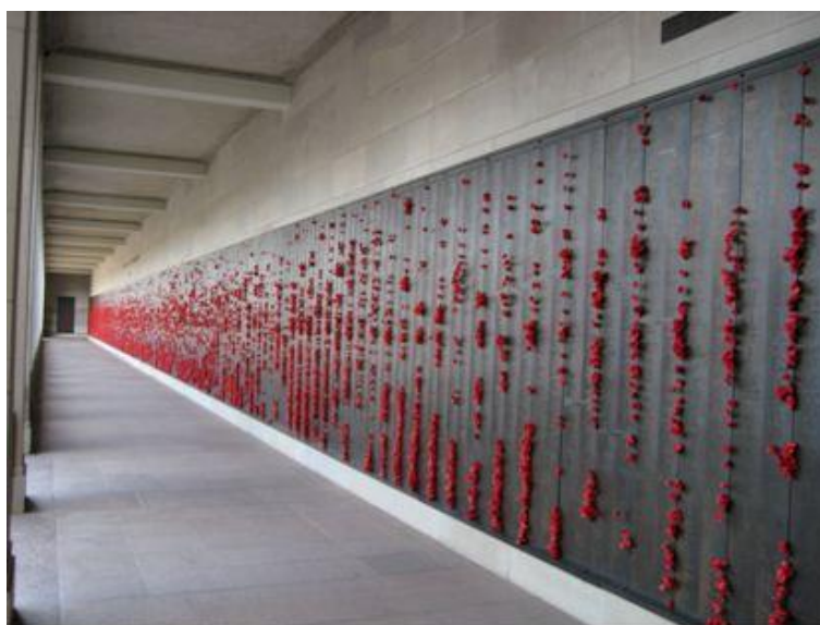
Roll Of Honour WW1 Australian War Memorial Canberra, Australia

W. Supple is also remembered on the Tallangatta Valley War Memorial located at Cravensville Road, Tallangatta Valley, Victoria.