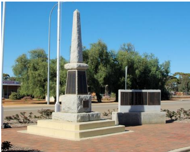
Quairading War Memorial

W. Haythornthwaite is also remembered on the Quairading War Memorial located opposite the old railway station between Quairading – York Road and Heal Street, Quairading, Western Australia.