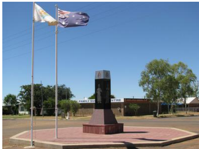
Boulia New War Memorial