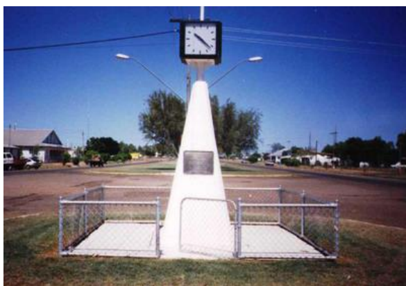
Boulia Old War Memorial

The Boulia War Memorial located at Herbert Street, Boulia, Queensland does not contain individual names. A New Memorial was dedicated in 2006.