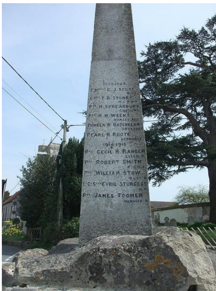
Durrington War Memorial