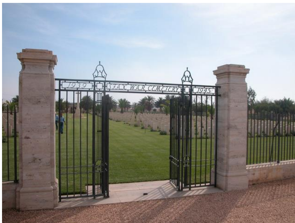
Sfax War Cemetery (Photo & information from CWGC)

The single First World War grave in Sfax War Cemetery was brought in from Bizerta Sidi Saleru Moslem Cemetery in March 1983. There is also 1 Greek soldier of the 1939-45 war buried here.