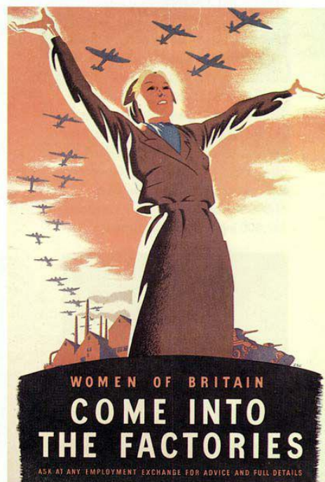
World War 2 poster