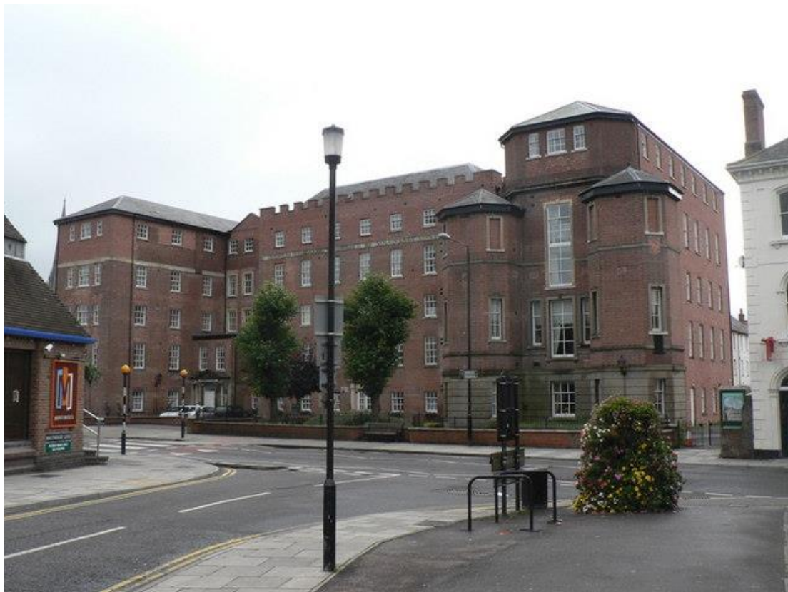
Salisbury – The Old Infirmary now residential