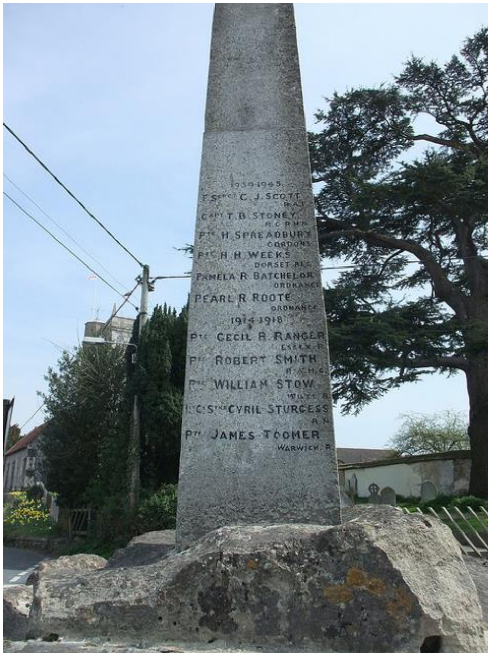
Durrington War Memorial