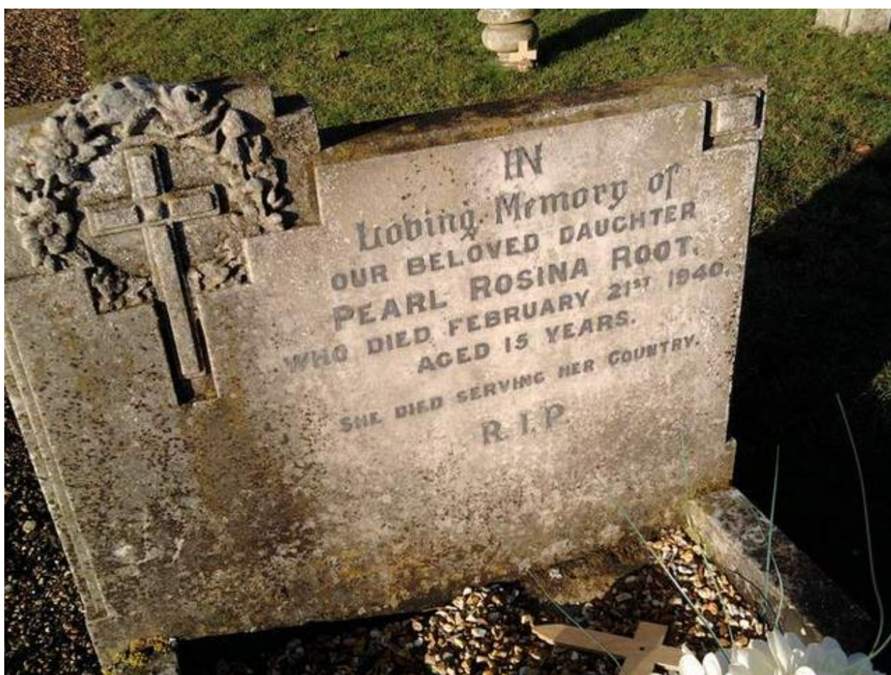
Headstone of Pearl Rosina Root

Pearl Rosina Root was buried in Durrington Cemetery, Wiltshire on 26th February, 1940 in Plot 1101.