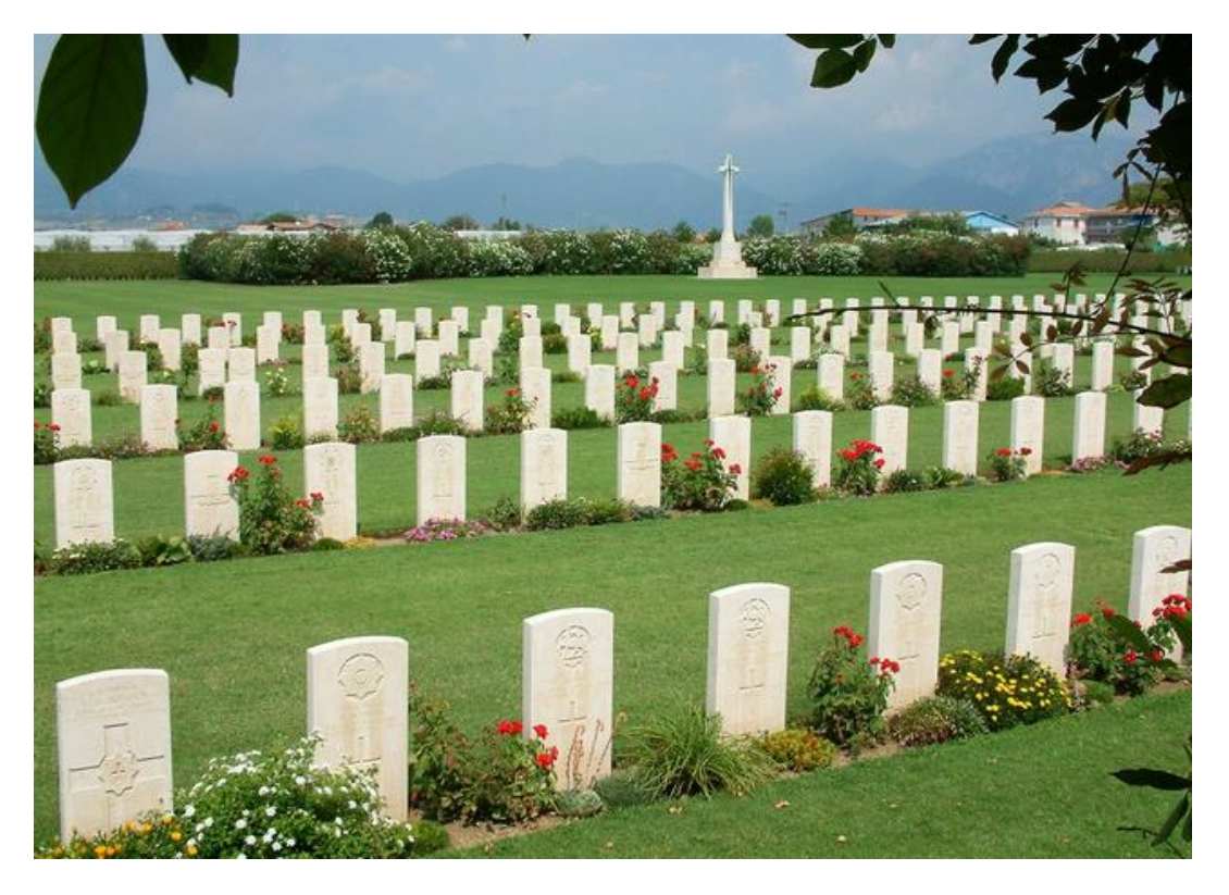
Salerno War Cemetery (Photos & information from CWGC)

Salerno War Cemetery contains 1,846 Commonwealth burials of the Second World War, 107 of them unidentified. One casualty of the First World War is also commemorated in the cemetery by special memorial, his grave in a local civil cemetery having been lost.