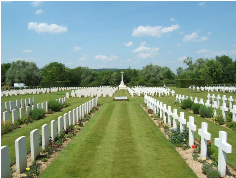
Choloy War Cemetery