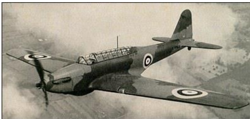
A Fairey Battle Bomber