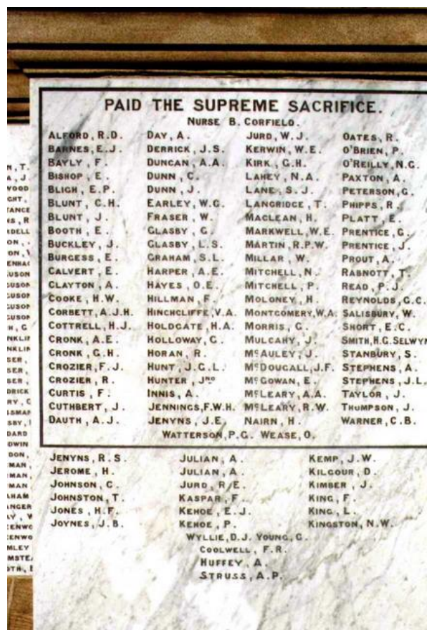
Beaudesert War Memorial