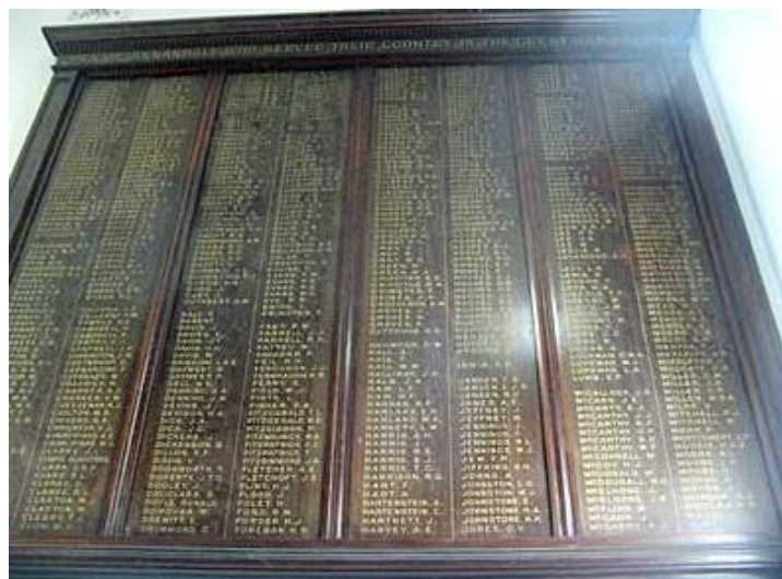
Annandale Roll of Honour WW1