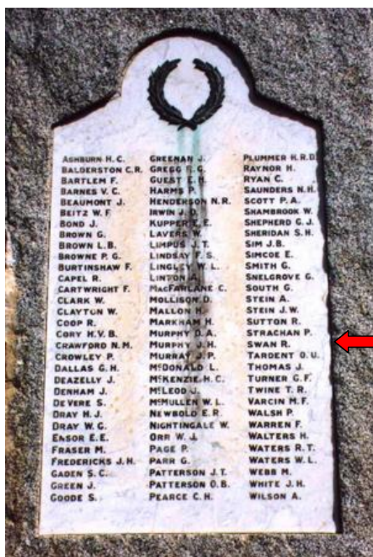
Roma War Memorial