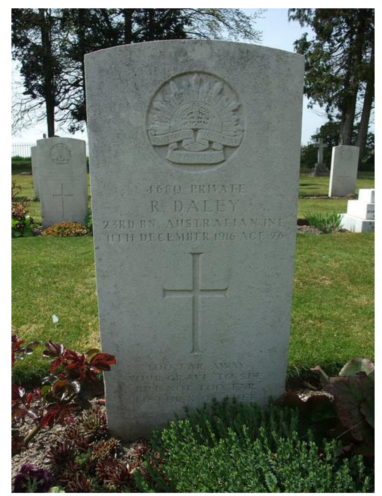
Photo of Pte R. Daley's Headstone at Durrington War Graves Cemetery, Wiltshire.

Too Far Away Your Grave To See But Not Too Far To Think Of Thee