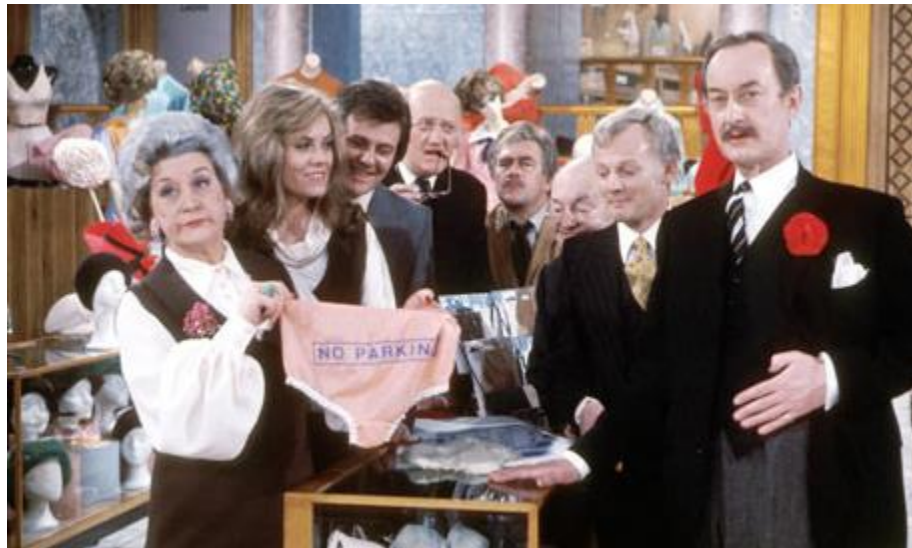
Trevor Bannister, third left, and the cast of Are You Being Served?

Actor known for his role as Mr Lucas in Are You Being Served?