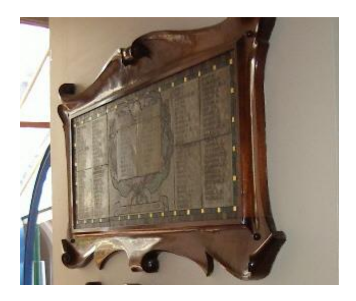
Launceston Pilgrim Uniting Civic Centre Honour Roll