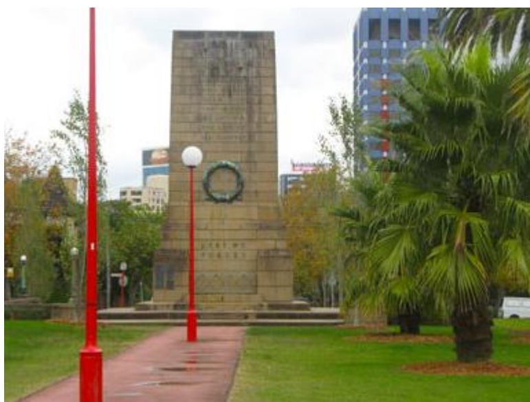
North Sydney War Memorial