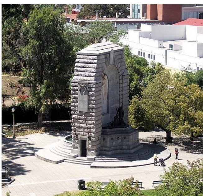
Adelaide War Memorial