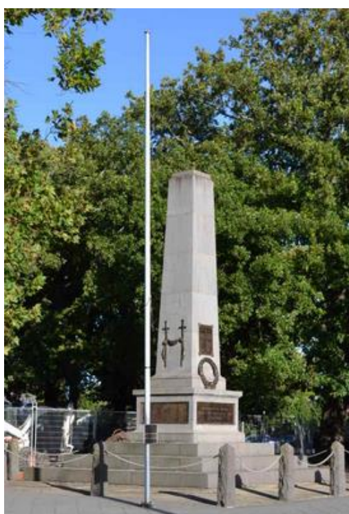
Kyneton War Memorial