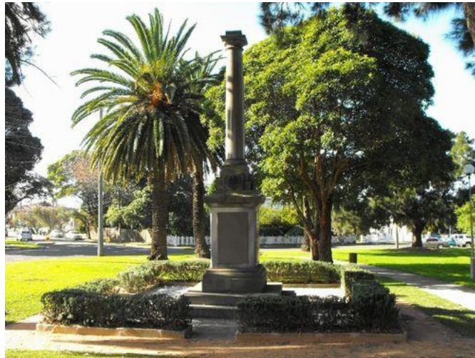
Kogarah War Memorial