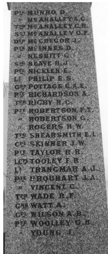
Coleraine War Memorial